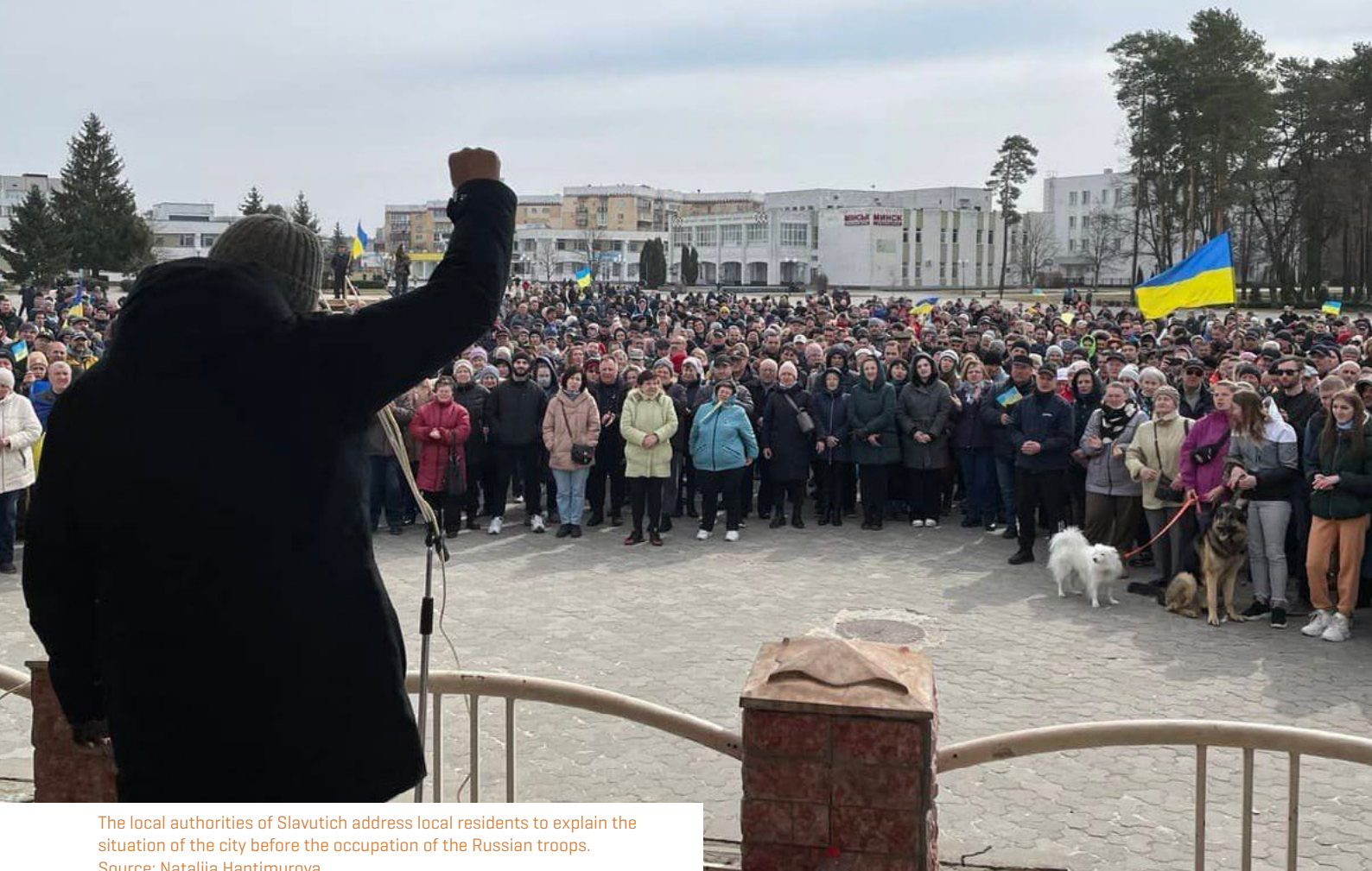
The local authorities of Slavutych address local residents to explain the situation of the city before the occupation of the Russian troops.

the responses to these needs were carried out by the social organisations themselves, but the authorities played an important role in the coordination of aid. Also noteworthy is the cooperation between local authorities and public protest actions such as in Slavutych or non-cooperation in the occupied areas.